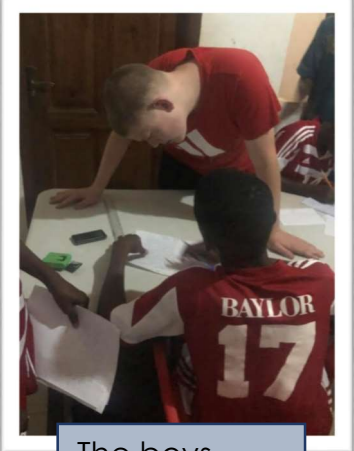
The boys replying to letters from their sponsors.