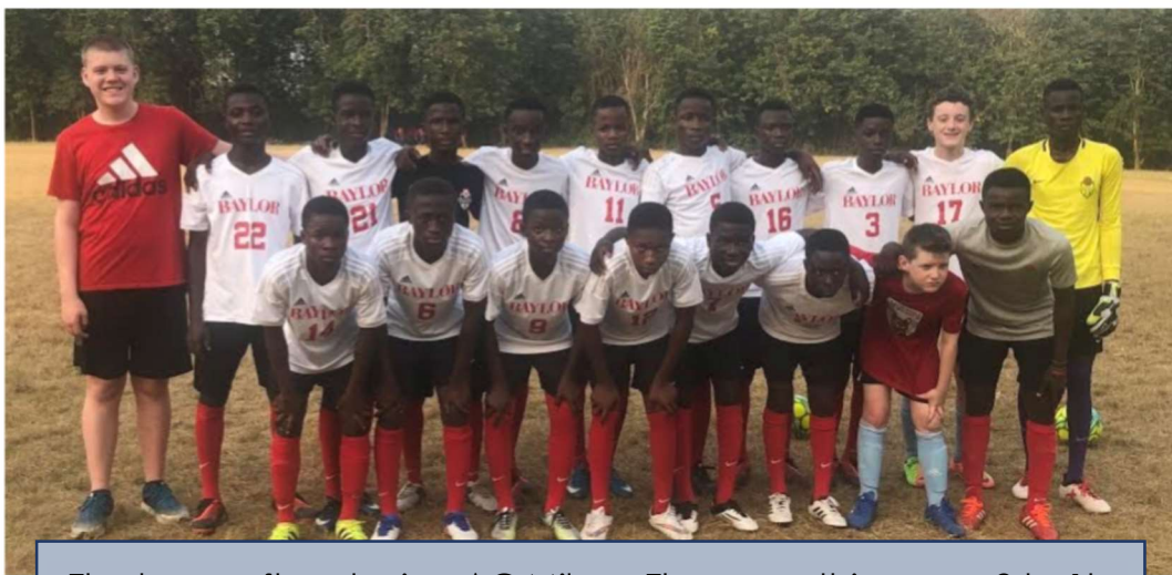
The boys, after playing AC Milan. They won this game 2 to 1!